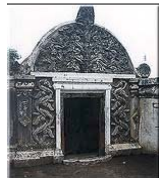
Gateway to the original Taman Sari

The word “Taman Sari” comes from the name of a building complex inside the Yogyakarta Royal Palace in central Java, Indonesia. The complex was built in 1758 by a Sultan (Javanese ruler) by the name Hamengku Buwono I. He had 4 purposes with this building complex: to become a rest house, to become a cultural and entertainment complex, to become a place for meditation and to become a sanctuary for him and his family. This fits well with the idea of a modern Spa: to become a place to relax, to relieve stress and to escape from everyday life. Spa Industry worldwide has been revolutionized by many Asian cultures: Indian Ayurvedha, Chinese TCM, Japanese Onsen, Thai Spa practice and now Indonesian Jamu that originates from inside the royal court of Java.