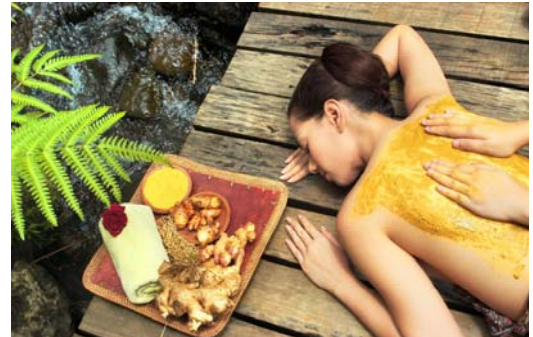
Javanese Lulur Body Scrub

A tropical paradise comprising some 17,000 islands and populated by an estimated 250 million people, Indonesia is home to thousands of Spas, day spas or resort spas alike. From the Balinese Boreh to Javanese Lulur, Indonesian Spa practices are forming its own character and reputation. One of the elements that are inseparable from our Spa practice is the use of Jamu or loosely translated as traditional herbal medicine (orally or externally). Jamu is a practice that is derived from the tradition inside the Royal court of Java, particularly from Keraton/Palace of Solo and Yogyakarta. It is from this Javanese Royal court tradition that Taman Sari Spa builds