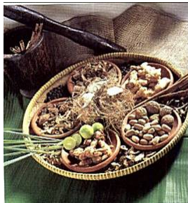
Ingredients of Jamu

its concept of Spa practices that now becomes available in Taman Sari Spa locations in 3 continents and 7 countries. Through this Javanese Spa tradition which is as old as the culture itself, people from around the world will begin to learn more about our cultural heritage. It is a culture that promotes not only harmony among its people but also harmony between human social/economical activities and its natural surroundings. It is essentially a culture that recognizes and preserves its ethnical and biological diversity background as source of all life on earth.