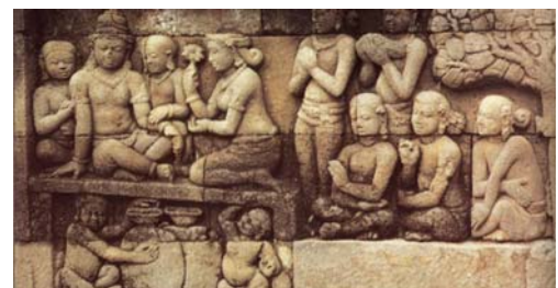
A stone carving on Borobudur temple depicting Jamu making tradition among the Javanese people in 7 th century

The ancient Javanese people lives intimately with plants around them and they regard plants as their partners to achieve this physical and spiritual balance. Therefore the knowledge on how to prepare plants as food and as medicine is always in the core Javanese woman's daily life. Javanese housewives always maintain a good collection of herbs and spices in their kitchen and prepare food for the family members with promoting the family's health in mind. They also know how to make specific Jamu to treat various illnesses.