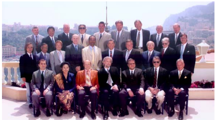
As the only Woman participating in World Entrepreneur of the Year 2003 competition in Monte Carlo